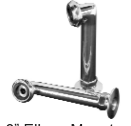
6" Elbow Mounts